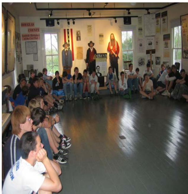
Students listen to the history of Constitution Hall.

At Lane Museum the students took on the roles of proslavery and antislavery settlers in Kansas as they participated in a town hall meeting at Lane Museum. This meeting took place in 1854. There were cheers from the antislavery side, as John Brown and James Lane addressed the meeting, and cheers from the proslavery crowd when Samuel Jones and David Atchison spoke to the people. The meeting was held to debate whether Kansas should be a free state or a slave state as it entered the Union.